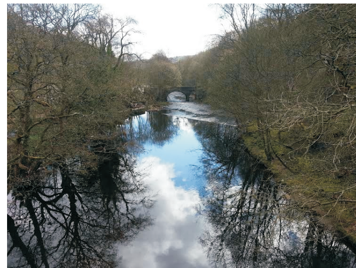
River Calder Hebden Bridge Sirius