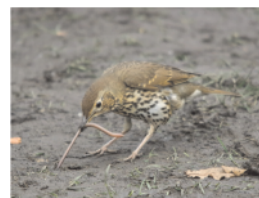
Clues background: 'Diet of Worms'