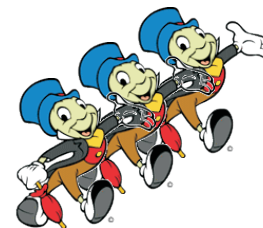
Three Crickets supporting Buddy Holly